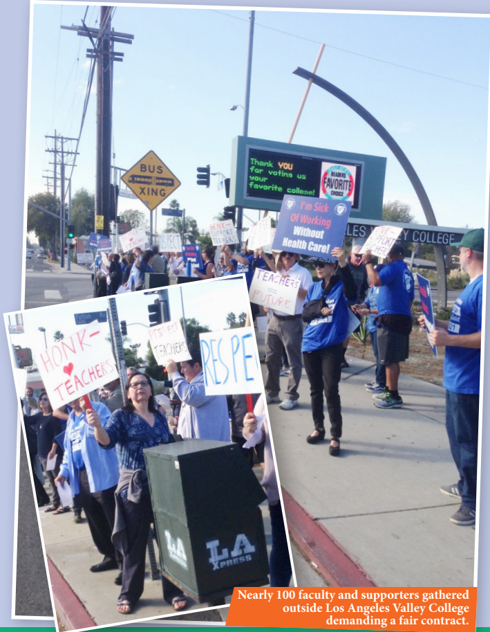
Nearly 100 faculty and supporters gathered outside Los Angeles Valley College demanding a fair contract.